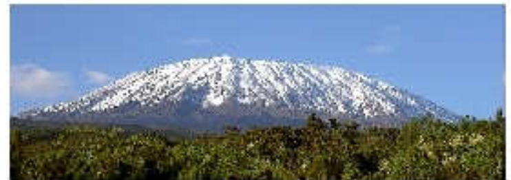
Kilimandjaro (Tanzanie) 5892 m